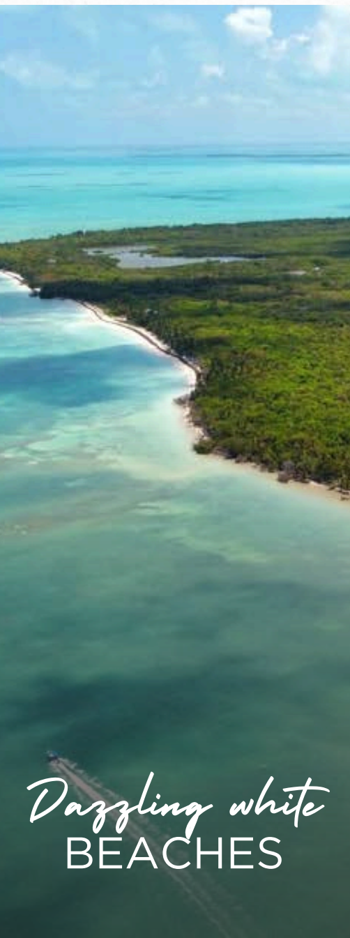
Dazzling white BEACHES