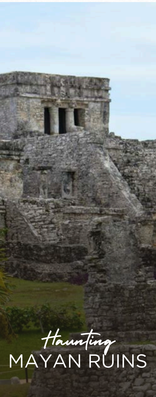
Haunting MAYAN RUINS