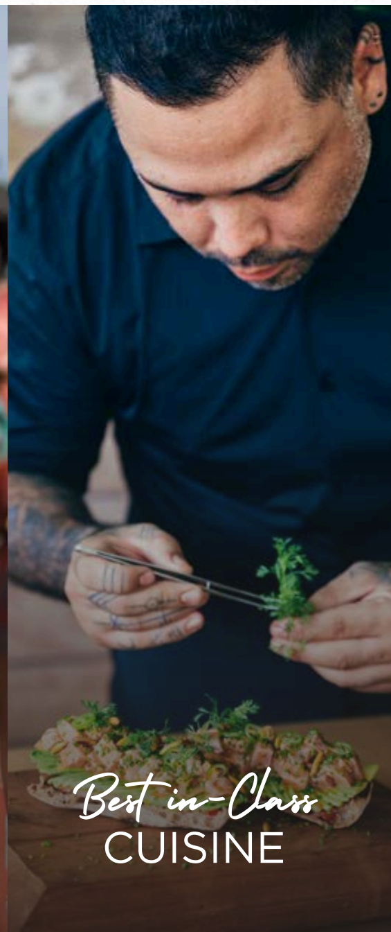
Best in-Class CUISINE